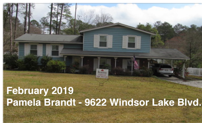
February 2019 Pamela Brandt - 9622 Windsor Lake Blvd.