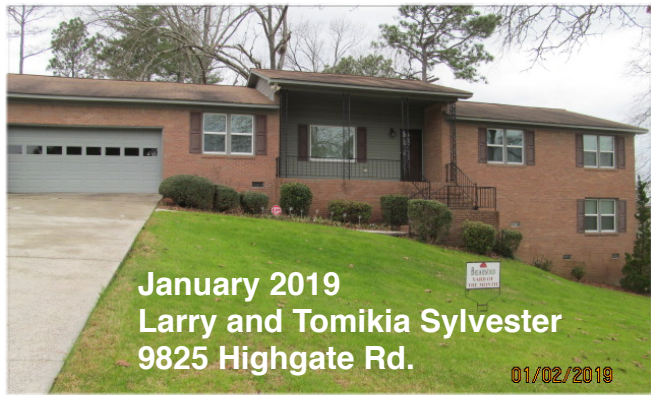
January 2019 Larry and Tomikia Sylvester 9825 Highgate Rd.