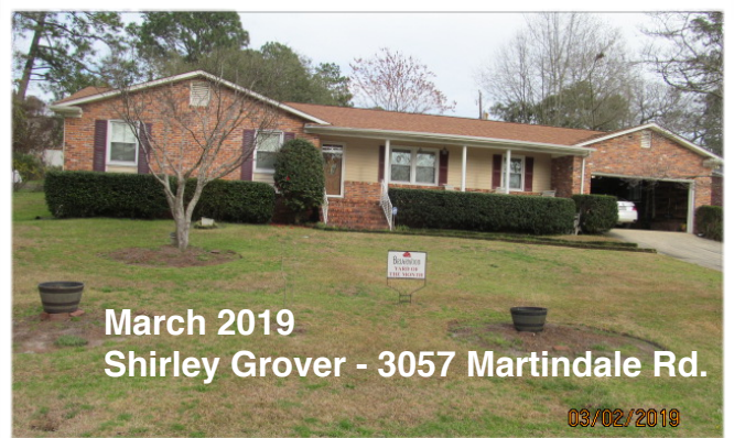
March 2019 Shirley Grover - 3057 Martindale Rd.